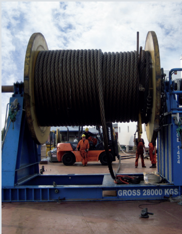
Diesel hydraulic spooler 250T

We also have a hydraulic wire rope tensioning machine with a back tensioning capacity of 45 tons. The machine is available for rental, with or without an operator.