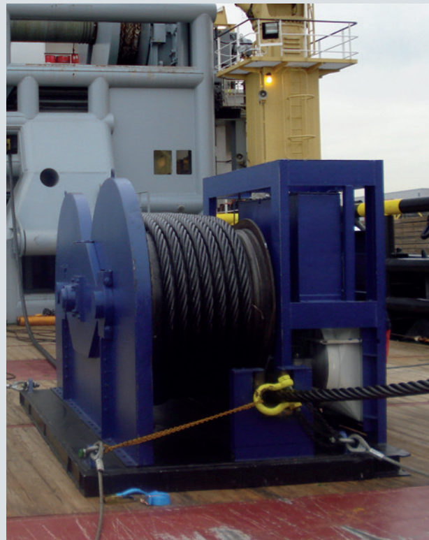
Tensioning machine HV 7